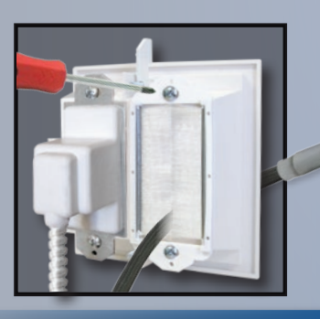
Décor Straps Install From Behind