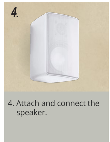
4. Attach and connect the speaker.