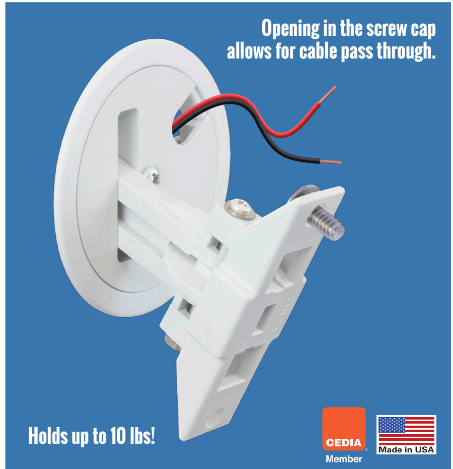
Opening in the screw cap allows for cable pass through.