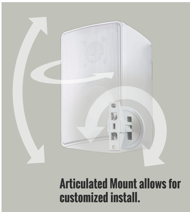
Articulated Mount allows for customized install.

The mount provides two locations to attach the speaker, whether utilizing one 1/4-20" bolt or two.