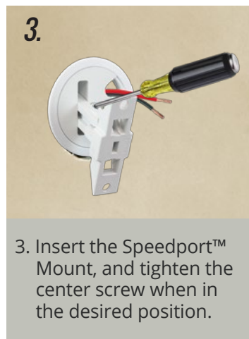
3. Insert the Speedport™ Mount, and tighten the center screw when in the desired position.